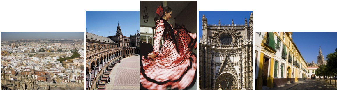
Images from left to right: “Sevilla, Spain”; “Plaza de España, Sevilla Spain”; “Flamenco Dancer”; “The Cathedral of Santa Maria in Sevilla, Spain”; “Buildings Lining a Street, with the Giralda in the Background, Sevilla, Spain” ( http://www.britannica.com/ ).

Location Description: “Andalusia, the southern region of Spain, offers sun and marvelous beaches, beautiful historic cities, unique traditional celebrations, friendly people, and a sparkling nightlife. It is also one of the richest parts of Europe in nature reserves and national parks, with a great variety in flora and fauna, and impressive landscapes. Situated in the cultural heart of Spain, the city of Seville truly brings the old world together with the new. At the crossroads of Europe, North Africa and Latin America, this land was the historical capital of the Moorish kingdom in Europe, the touchstone of Castilian re-conquest of the Iberian Peninsula, and the seat of colonial administration for Latin America” ( http://ois.fiu.edu/docs/flyer_2008_sevilla6f962476.pdf ).